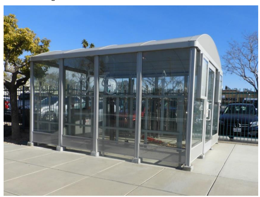
Bike Hut Storage outside of the Riverside-Downtown Metrolink Station

As part of outreach efforts related to the Commuter Rail First Mile/Last Mile Active Transportation Strategies Project, RCTC completed a Public Outreach Plan that was used to develop an approach to reaching current and prospective riders within the region to promote the first mile/last mile improvements at the stations. The plan had the following goals: